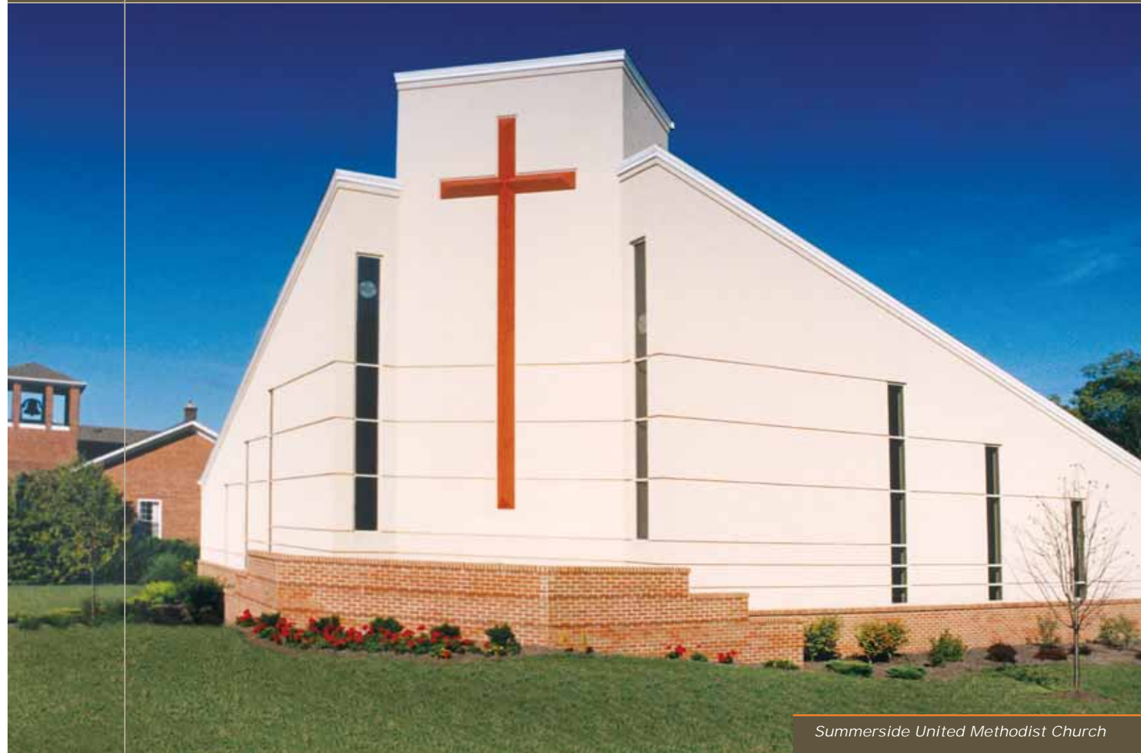
Summerside United Methodist Church

Miller-Valentine understands that your needs and vision are unlike any other. That's why we'll do more than simply bring you our years of experience and expertise in creating quality-built religious facilities to your new building or addition. We'll bring sensitivity and a commitment to quality to our partnership as well, a combination that lets us customize exactly the right solution for you and your church.