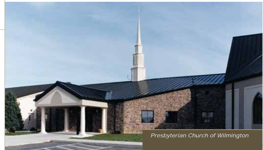
Presbyterian Church of Wilmington

"We are very pleased with the strengths Miller-Valentine brings to the table. The project... has been tailored to our needs and budget. We highly recommend them to any group planning religious facility construction."