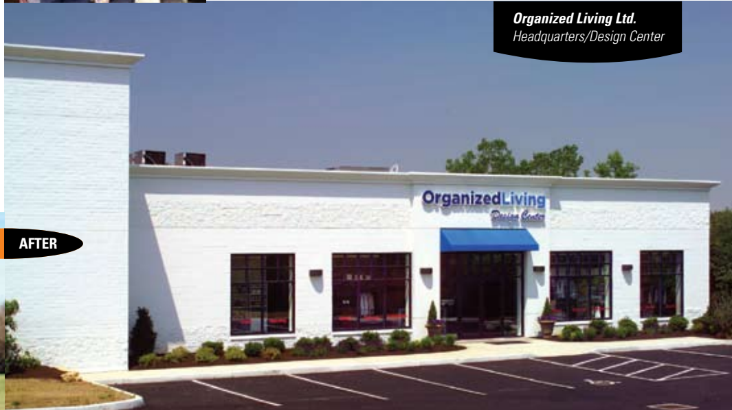
Organized Living Ltd. Headquarters/Design Center