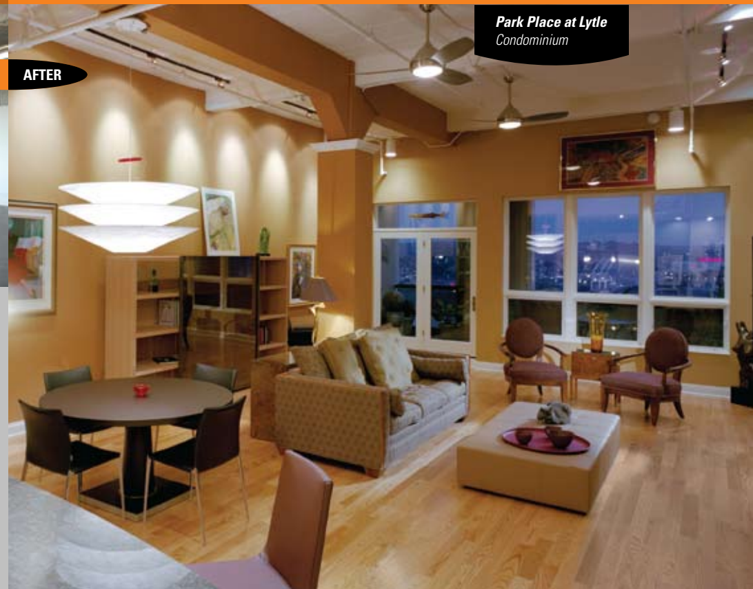
Park Place at Lytle Condominium

“You can tell they took pride in their work.”