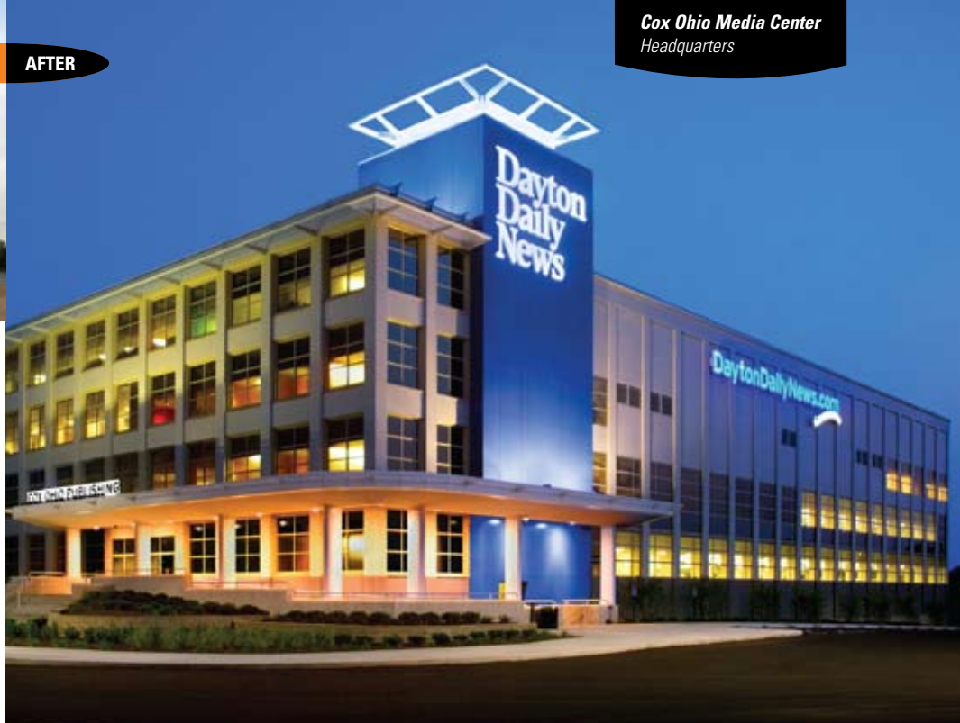
Cox Ohio Media Center Headquarters

“Transforming a 50-year-old manufacturing facility into a Class A, leading edge work environment for almost 700 employees sounded like a monumental task, but working with Miller-Valentine Group made the whole process effortless.”