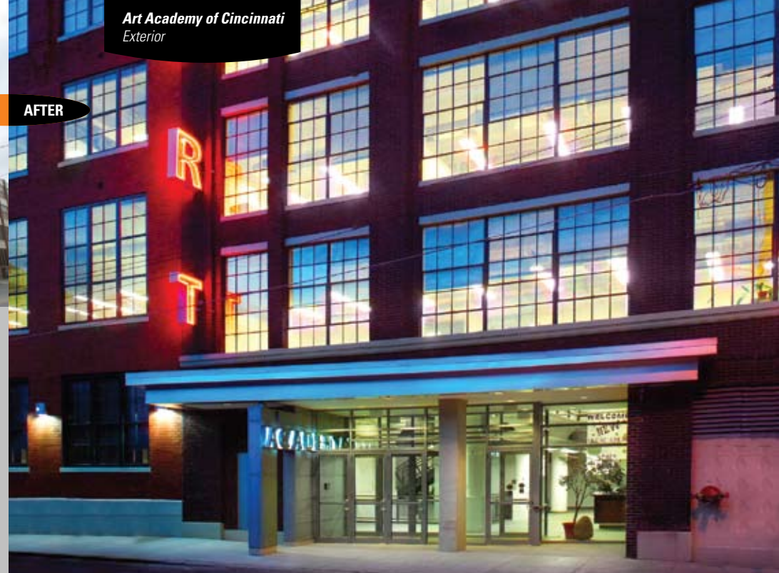
Art Academy of Cincinnati Exterior

“As you know, the budget and schedule were both tight. Nevertheless your firm’s professionalism, can-do attitude, and construction knowledge under our design/build agreement produced a successful result.”