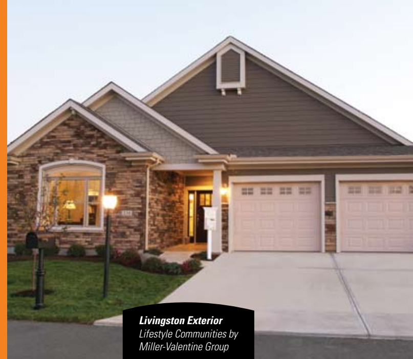
Livingston Exterior Lifestyle Communities by Miller-Valentine Group

BUT MV RESIDENTIAL BUILDS MUCH MORE THAN HOUSING ALTERNATIVES. WE ALSO BUILD RELATIONSHIPS, LONG-TERM RELATIONSHIPS THAT BRING YOU THE BENEFIT OF OUR ACCUMULATED EXPERIENCE AND EXPERTISE. WE'VE BEEN ABLE TO DEVELOP AND MAINTAIN THOSE LASTING RELATIONSHIPS FOR TWO CRUCIAL REASONS: FIRST, WE LISTEN TO YOU; THEN WE PROVIDE JUST THE RIGHT BLEND OF PRODUCTS AND SERVICES THAT MEET YOUR UNIQUE REQUIREMENTS.