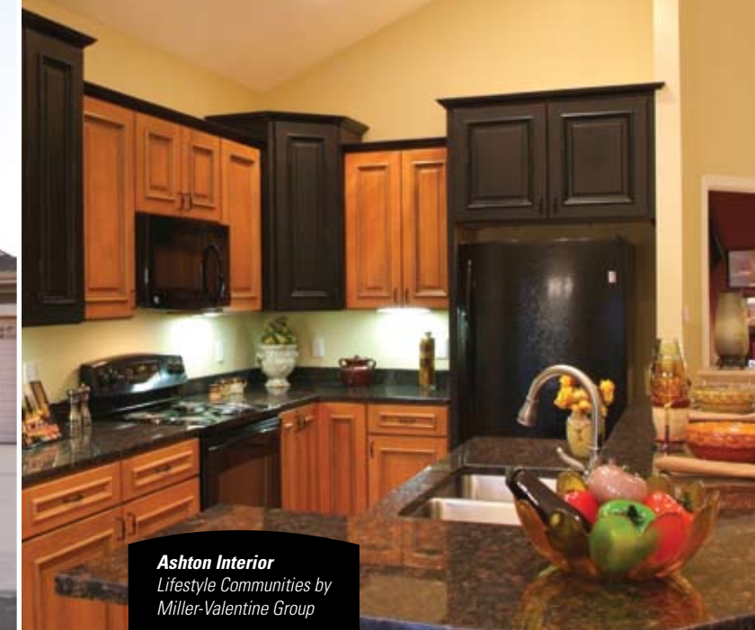
Ashton Interior Lifestyle Communities by Miller-Valentine Group