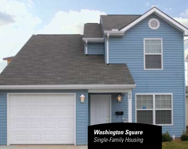
Washington Square Single-Family Housing