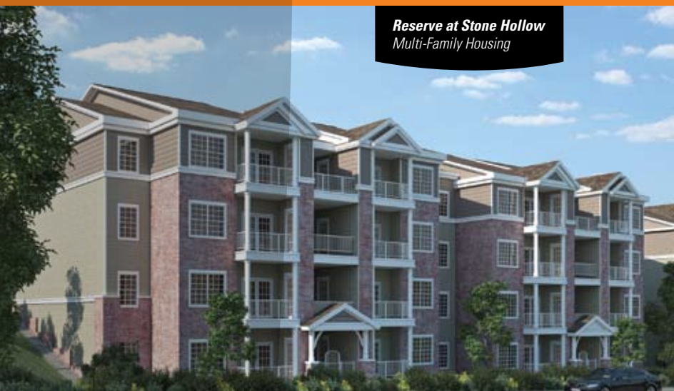
Reserve at Stone Hollow Multi-Family Housing