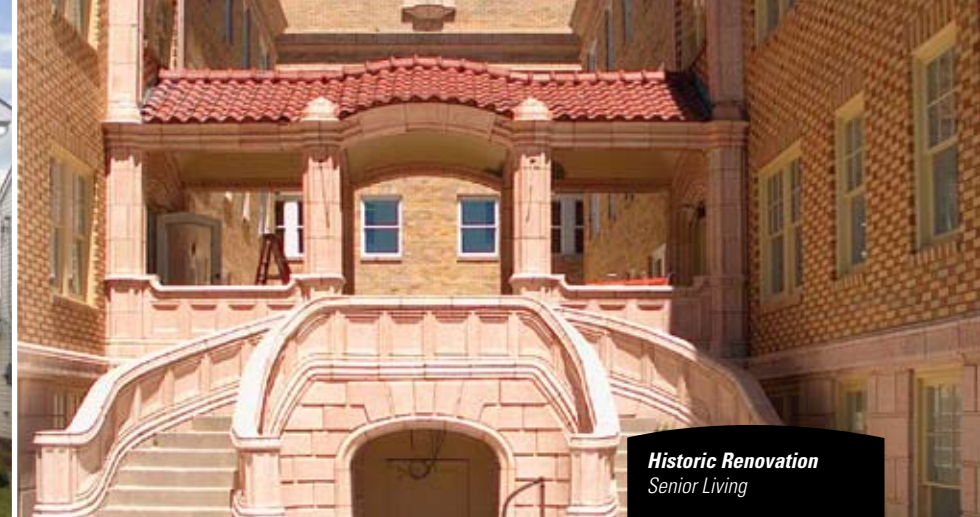
Historic Renovation Senior Living