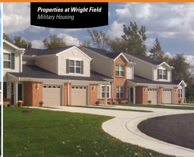
Properties at Wright Field Military Housing