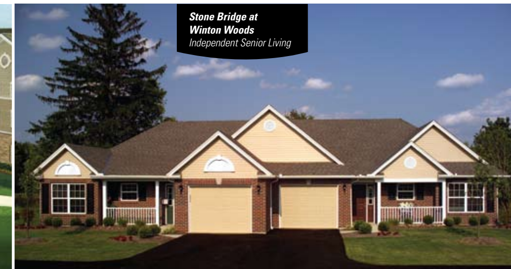
Stone Bridge at Winton Woods Independent Senior Living