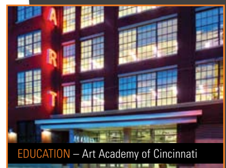
EDUCATION – Art Academy of Cincinnati