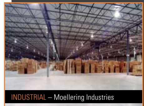
INDUSTRIAL – Moellering Industries