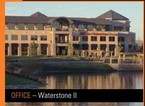
OFFICE – Waterstone II