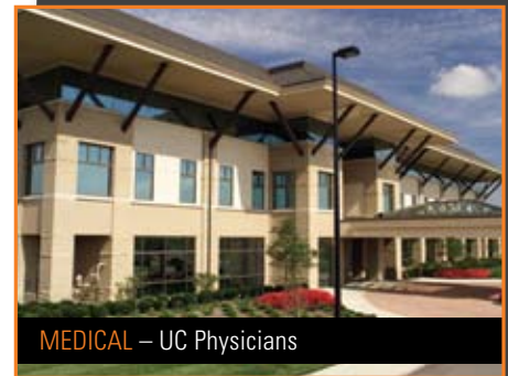
MEDICAL – UC Physicians