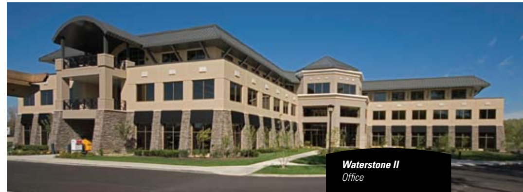
Waterstone II Office