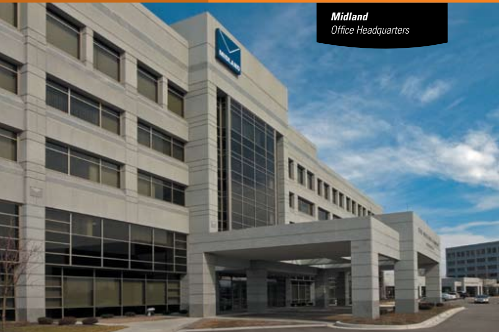
Midland Office Headquarters

BECAUSE MILLER-VALENTINE OWNS MORE THAN 10 MILLION SQUARE FEET OF REAL ESTATE, WE BRING A UNIQUE OWNERSHIP PERSPECTIVE TO YOUR DESIGN/BUILD PROJECT. AND BECAUSE WE CAN PROVIDE REAL ESTATE, DEVELOPMENT, FINANCING, BROKERAGE AND LEASING SUPPORT, WE ADD VALUE IN THE FORM OF BROAD EXPERIENCE AND EXPERTISE UNCOMMON IN OUR INDUSTRY. WE ARE A TOTAL REAL ESTATE SOLUTIONS PROVIDER.