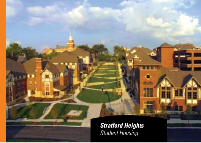
Stratford Heights Student Housing