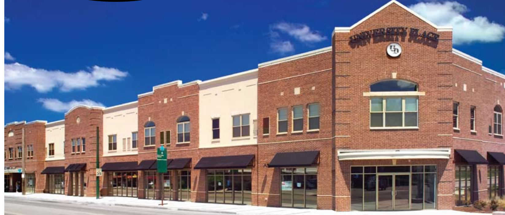
University Place Mixed Use Office/Residential

WHEN IT'S TIME TO BUILD, MILLER-VALENTINE GROUP LISTENS CLOSELY TO YOUR NEEDS AND OFFERS CONSTRUCTION SOLUTIONS AS WELL AS FLEXIBLE DELIVERY SYSTEMS AND OWNERSHIP OPTIONS.